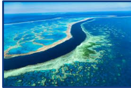
The Great Barrier Reef