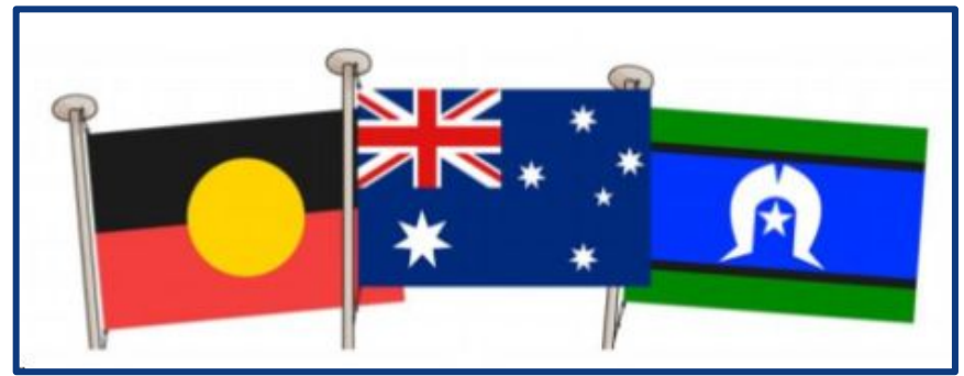
The three flags of Australia